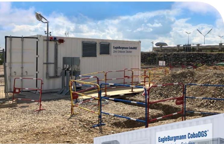
CobaDGS high pressure nitrogen generator and supply system on the operator's site.